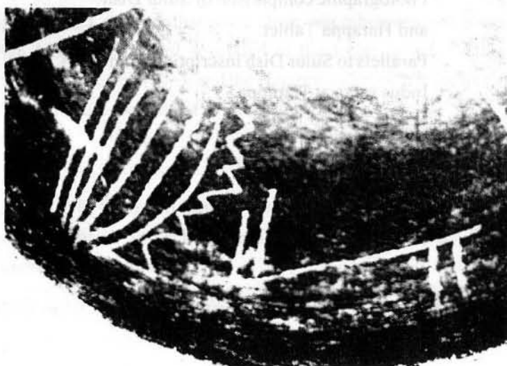
Figure 1A: Inscription on the Sular Dish (detail)