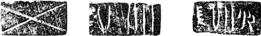
Figure 2: Miniature Tablet from Harappa inscribed on three sides (IM 4581=CISI-I: H-351)